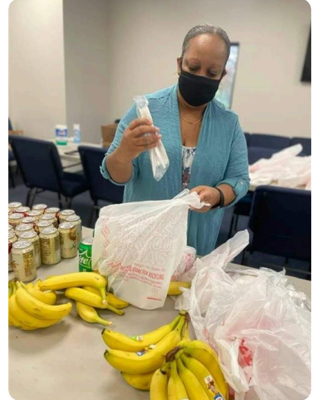
Prepared lunch monthly for the homeless. We already miss you.