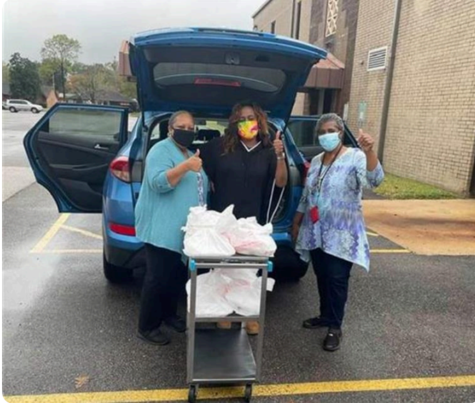
Always working to make a different with CLAME WMS